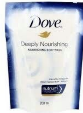
Dove Nourishing Body Wash