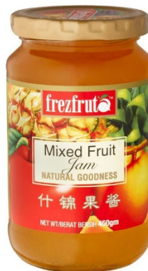
Frezfruit Mixed Fruit Jam