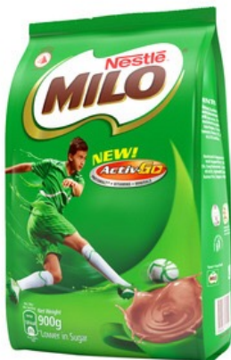
Milo Refill Pack