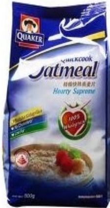
Quaker Quick Cook Oatmeal