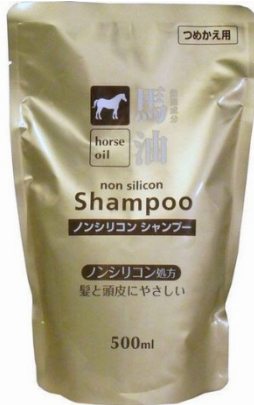
Non Silicon Shampoo

The pictures of these items are attached for your reference.